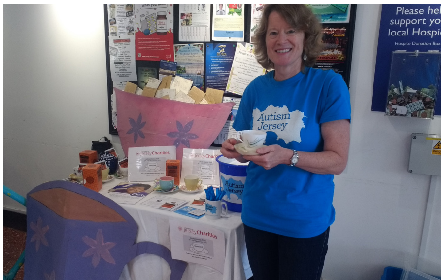
Autism Jersey fundraising