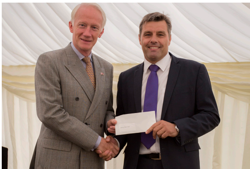
Lt Gov and Centre Point Trust, third placed Medium Charity of the Year, 2017